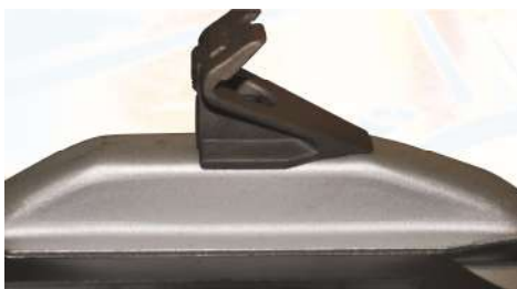
Strong and durable made of special steel