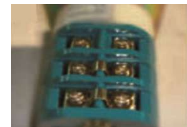
Universal switch with 40A silvered contacts which are more robust and better life span