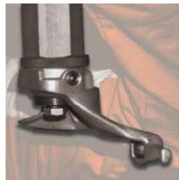
Universal switch with 40A silvered contacts which are more robust and better life span