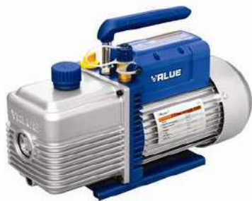
EV PUMP Fitted with EV pump which consumes 4 times less electricity cost