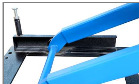
Heavy Duty Structure with Smooth Scissors Movement