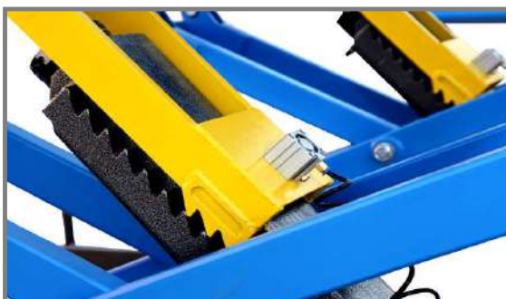
Double Safety Device - Mechanical Lock